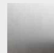
4 MM SOLID MATT BRUSHED