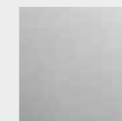
4 MM SOLID HOT-ROLLED

Countertops made of hot-rolled stainless-steel retain their natural properties and are even less susceptible to scratches. Minor imperfections in colour and texture are possible.